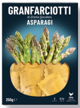
ASPARAGUS RAVIOLONI 250g