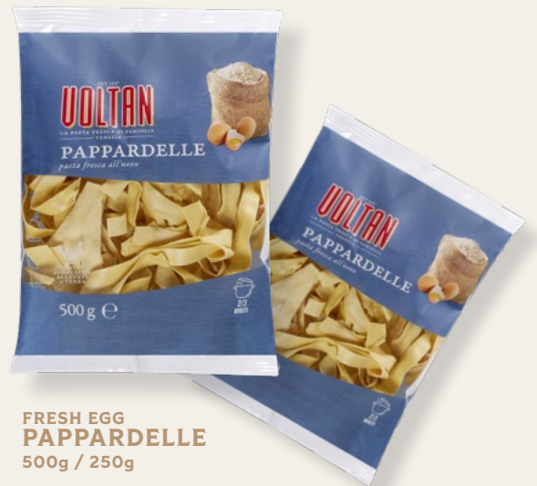
FRESH EGG PAPPARDELLE 500g / 250g