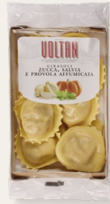
BUTTERNUT SQUASH AND SMOKED PROVOLA GIRASOLI 250g