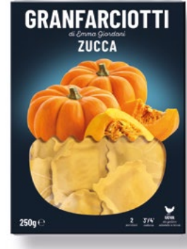
PUMPKIN RAVIOLONI 250g