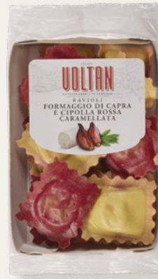
GOAT CHEESE AND CARAMELISED ONION RAVIOLI 250g