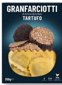
TRUFFLE MEZZELUNE 250g