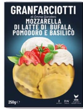
BUFFALO MILK MOZZARELLA & TOMATO MEZZELUNE 250g