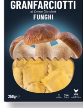
MUSHROOM RAVIOLONI 250g