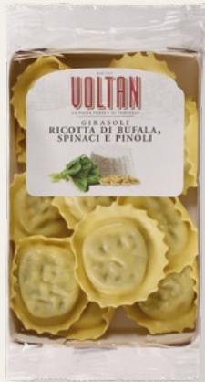
BUFFALO RICOTTA, SPINACH AND PINENUTS RAVIOLI 250g