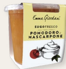
TOMATO & MASCARPONE 300g