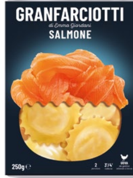
SALMON GIRASOLI 250g