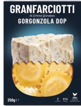
GORGONZOLA GIRASOLI 250g