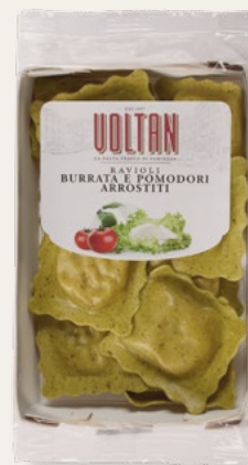
ROASTED TOMATO AND BURRATA RAVIOLI 250g