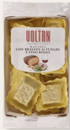
BRAISED BEEF, MUSHROOMS AND RED WINE RAVIOLI 250g