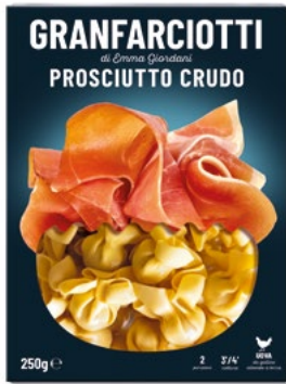
CURED HAM SACCOTTINI 250g