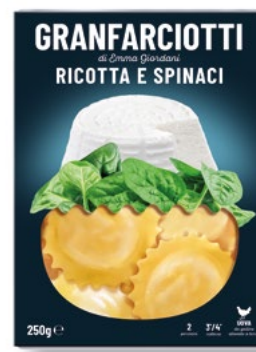
SPINACH & RICOTTA GIRASOLI 250g