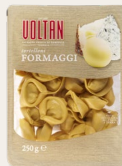
CHEESE TORTELLONI 250g